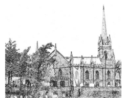
St. Brendan's Birr